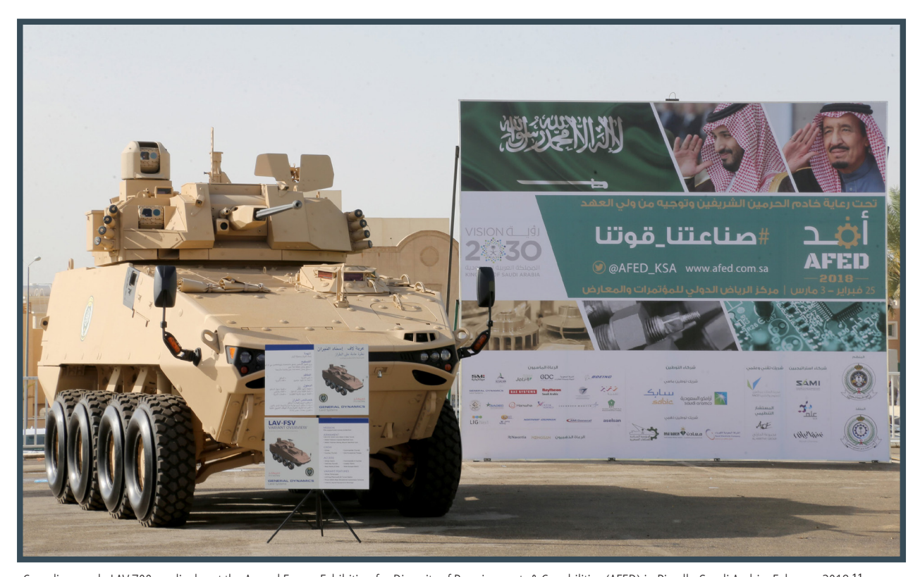
Canadian-made LAV 700 on display at the Armed Forces Exhibition for Diversity of Requirements & Capabilities (AFED) in Riyadh, Saudi Arabia, February 2018.<sup>11</sup>