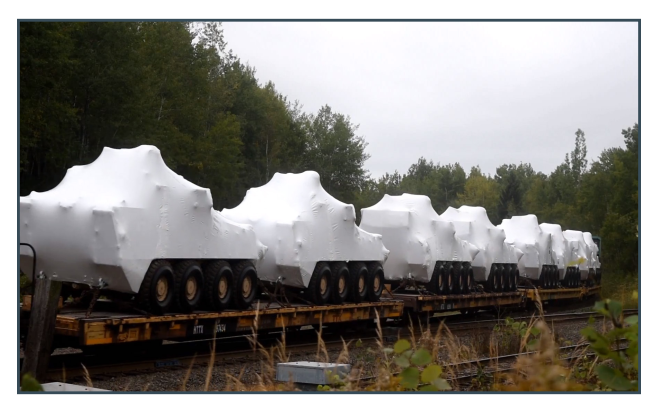
LAVs pictured outside of Moncton, New Brunswick, en route to the Port of Saint John for transport to Saudi Arabia, 18 September 2018.<sup>219</sup>

Canada should thereafter fully incorporate all provisions of the ATT into the EIPA, including a definition of "substantial risk." The government should then consider introducing greater parliamentary scrutiny of Canadian export controls, policy and practice, and complement it with the creation of an arm's-length advisory panel of experts to review best practices and support State Parties' compliance with the ATT. These considerations would not only ensure Canada's full compliance with the international obligations to which it has acceded, but would also reduce the likelihood that Canadian weapons will be used to violate human rights abroad.