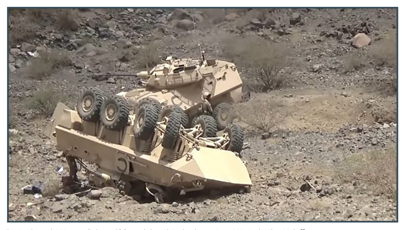
Two Canadian-made LAVs reportedly destroyed following clashes with Houthi militants in August 2019. 82