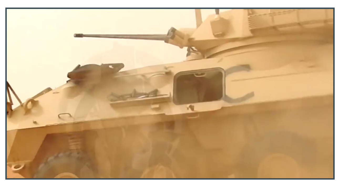
Canadian-made LAVs reportedly operated by Yemeni government forces in Hajjah Province, Yemen, second angle, May 2018.<sup>210</sup>