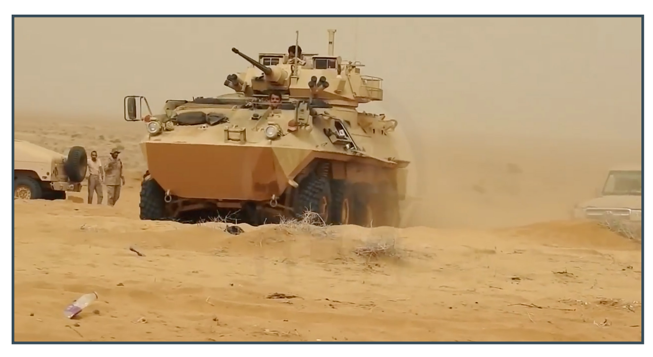
Canadian-made LAVs reportedly operated by Yemeni government forces in Hajjah Province, Yemen, May 2018.<sup>209</sup>