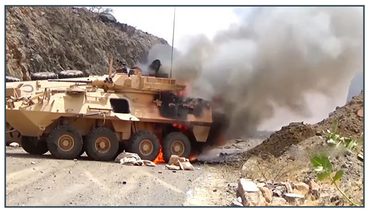
Canadian-made LAV-25 reportedly destroyed following clashes with Houthi militants in August 2019.<sup>81</sup>